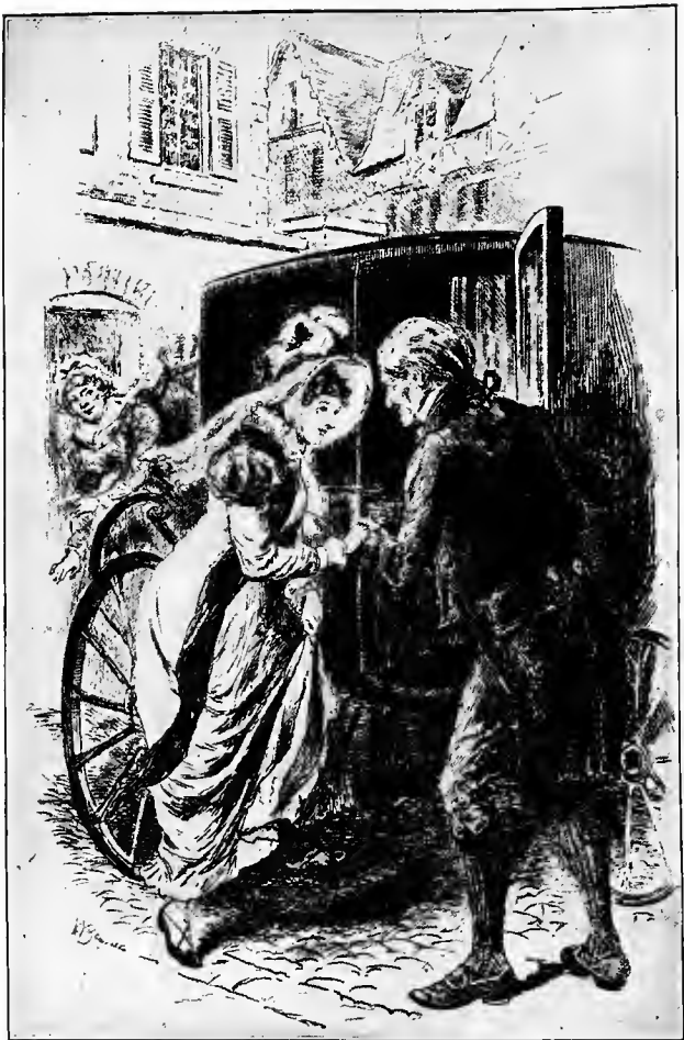
There was a splendid carriage waiting . . . and she got into it